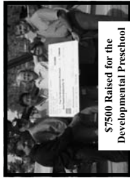
$7500 Raised for the Developmental Preschool Program