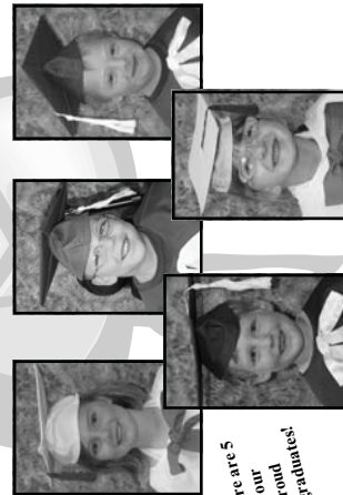
Here are 5 of our proud graduates!

Tiny Tim celebrated the graduation of 48 students on May 22, 2008. Of those students, 75% are attending kindergartens at their neighborhood schools, 25% are attending developmental kindergartens (8% Charter/Private schools (9%), Center-Based Programs (8%), Home-School (1%)