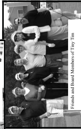
Friends and Board Members of Tiny Tim