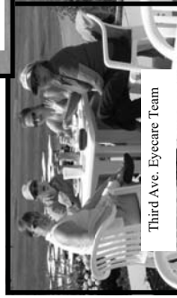
Third Ave. Eyecare Tenn